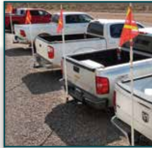
TW11D-X- 11' (3.35m)

(Available in 11', 13', 15' and 21' lengths)