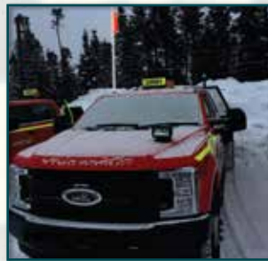
SDL06W-XY- 6' (1.83m)

(Available in 4', 6', 8' and 10' lengths)