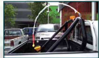
SD05-X-30B-2CA- 5' (1.52m) (Shown on right with AL2CA)

(Available in 3', 5', 8', 10' and 12' lengths)